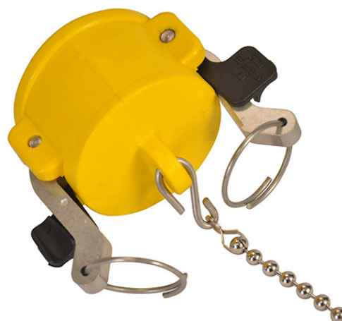
Style 4475 AkroFam (with old control ring)